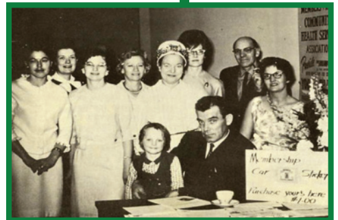
April 2 Grand opening of Regent Park clinic, 3765 Sherwood Drive

An anniversary is time to celebrate the joys of today, the memories