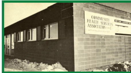
Expansion plans included a new Regent Park clinic facility