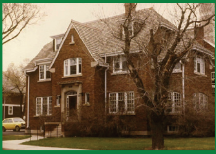
Our first home - 2363 McIntyre Street